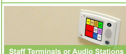
Staff Terminals or Audio Stations